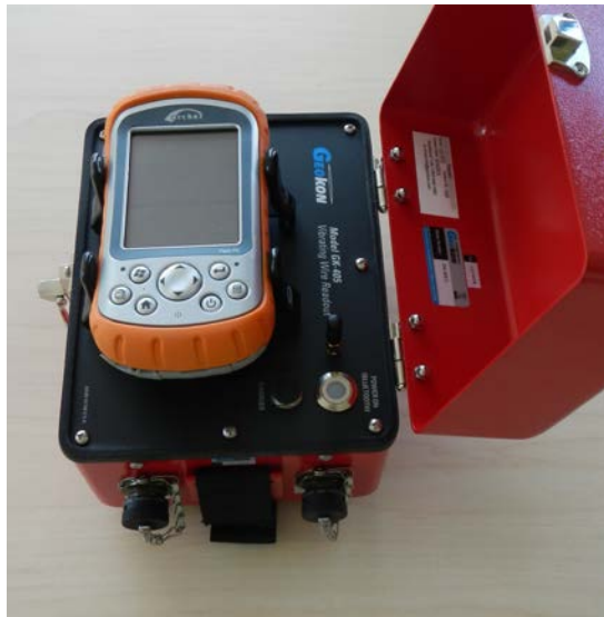
Figure 3 GK-405 Readout Unit

The two components communicate wirelessly using Bluetooth ® , a reliable digital communications protocol. The Readout Unit can operate from the cradle of the Remote Module (see Figure 3) or, if more convenient, can be removed and operated up to 20 meters from the Remote Module