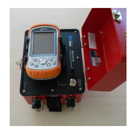
Figure 3 GK405 Readout Unit

The two components communicate wirelessly using Bluetooth<sup>®</sup>, a reliable digital communications protocol. The Readout Unit can operate from the cradle of the Remote Module (see Figure 3) or, if more convenient, can be removed and operated up to 20 meters from the Remote Module