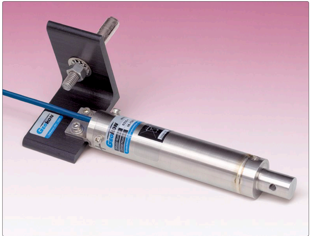
• Model 6350 Vibrating Wire Tiltmeter shown with mounting bracket assembly.