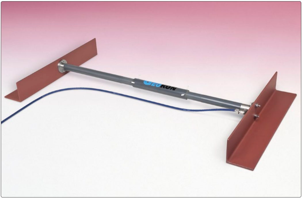
• The Model 4435 Vibrating Wire Soil Extensometer.