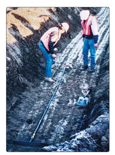
Installation of Model 4435 sensors.