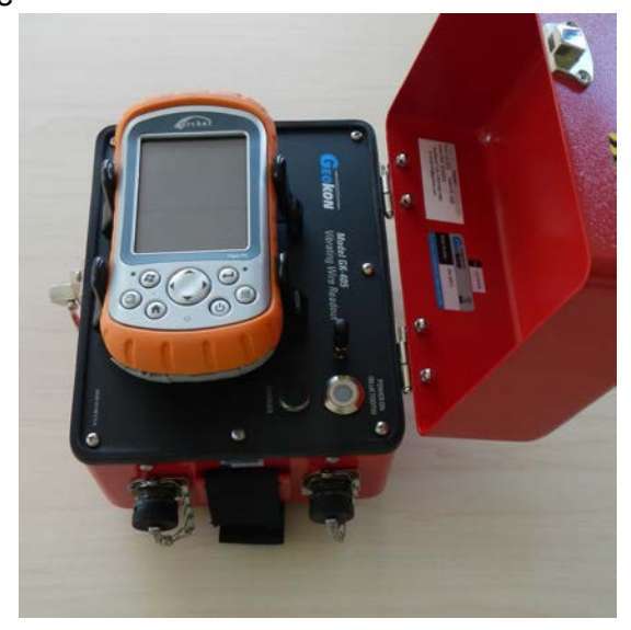
Figure 3 GK405 Readout Unit

The two components communicate wirelessly using Bluetooth<sup>®</sup>, a reliable digital communications protocol. The Readout Unit can operate from the cradle of the Remote Module (see Figure 3) or, if more convenient, can be removed and operated up to 20 meters from the Remote Module