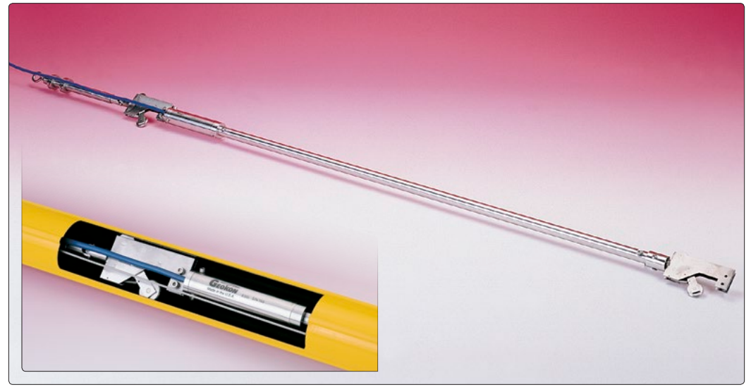
Model 6300 VW In-Place Inclinometer. Inset photo reveals installation detail with section of Model 6500 Inclinometer Casing removed.