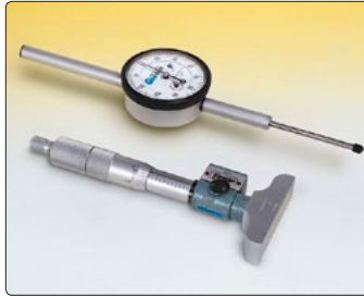
• Model 1400-1 Dial Indicator (top) and Model 1400-4 Digital Depth Micrometer.

Electronic readout is achieved using Model GK-404 or GK-405 Vibrating Wire Readouts (Model 4450) or the Model RB-100 Linear Potentiometer Readout (Model 1500). (See below).