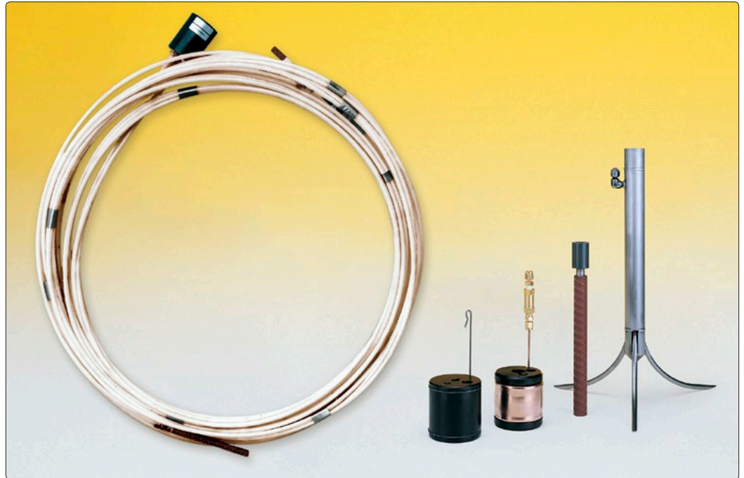
• Model A-6 assembled with groutable anchors and coiled for shipment. All anchor options shown right (left to right): Snap-Ring, Hydraulic, Groutable and Borros Type.