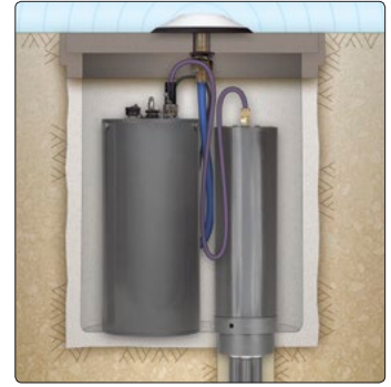
• Model 8026 Datalogger and Model 1280 (A-6) Extensometer in manhole.

Automatic monitoring is best accomplished using the Model 8021 or Model 8025 Dataloggers which can be configured to read at predetermined intervals, and to initiate alarms in the event threshold levels are exceeded. Alternatively, for extensometers installed in active roadways the Model 8026 Wireless Datalogger provides a convenient option.