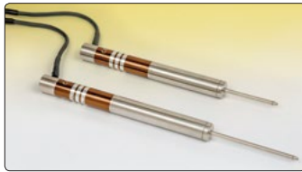
• Model 1450 DC-DC LVDT

DC-DC LVDT's for dynamic and/or high temperature applications are also available. Standard ranges are 50 mm, 100 mm and 150 mm. Other ranges available on request.