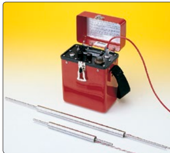
• Model 1500 Linear Potentiometer pictured with Model RB-100 Readout.

The Model 1500 utilizes a sturdy 6.5 mm diameter rod which protrudes from both ends as the actuating shaft. This facilitates connection of the linear potentiometer to extensometer rods and also permits a mechanical check on the readings using either a dial indicator or a depth micrometer.