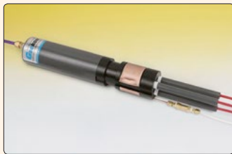
• Model A-6 Flexible Rod Extensometer, with flangeless type head assembly.